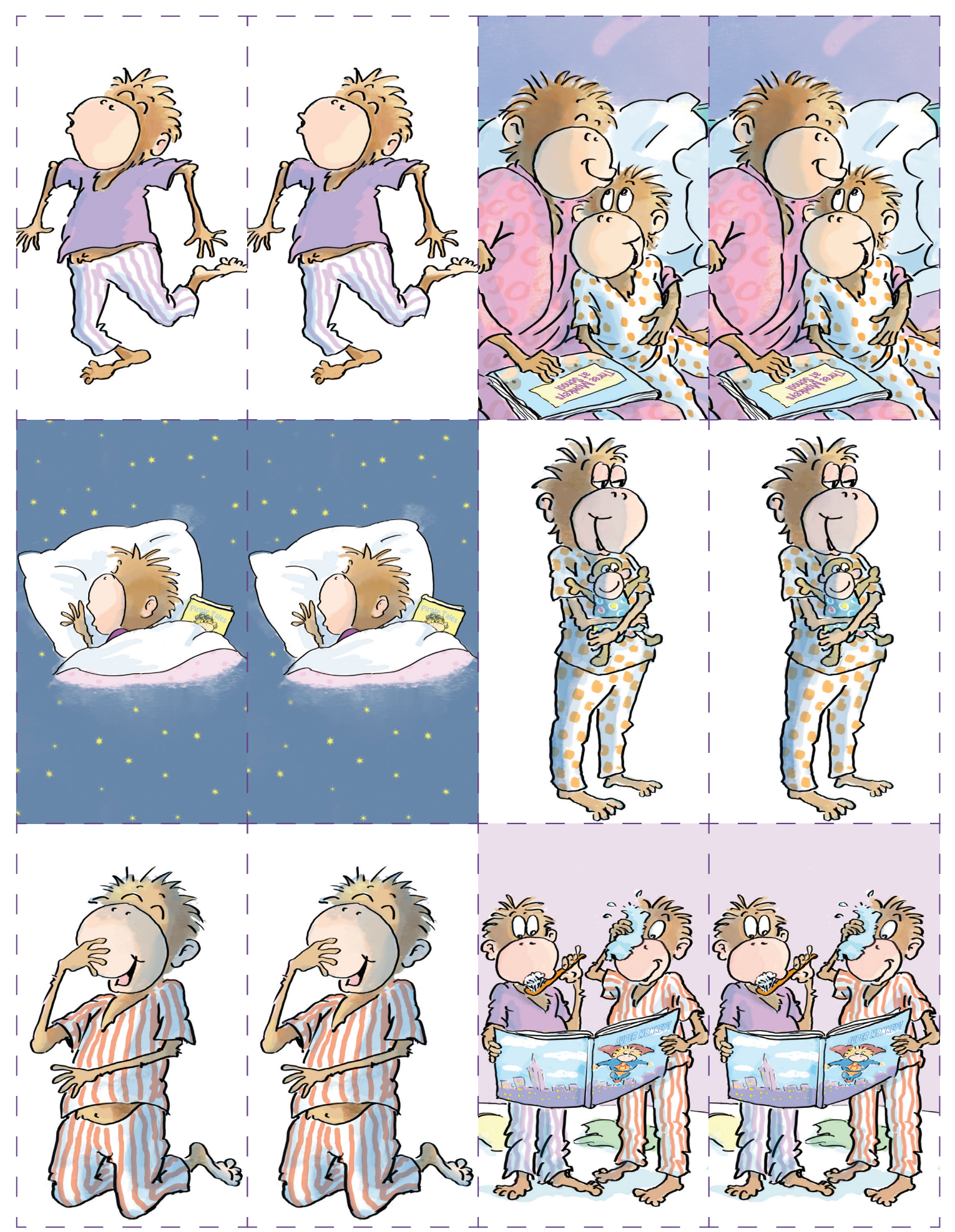
Illustrations © 2011 by Eileen Christelow from Five Little Monkeys Reading in Bed. All rights reserved. This page may be photocopied for free distribution.